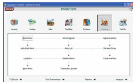
Easily manage your inventory