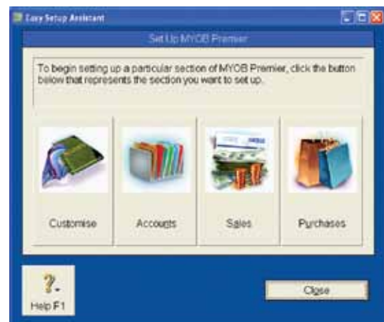
Easy to set up and use