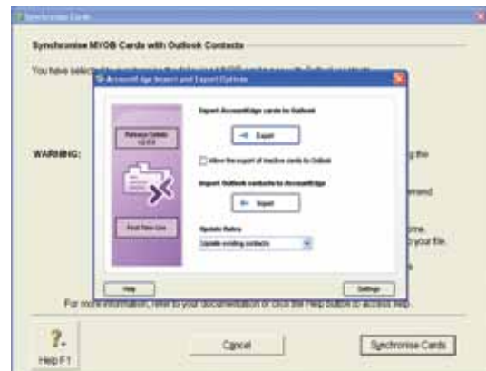
Effectively manage your customers