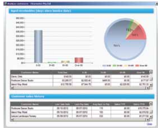
Quickly view your financial position